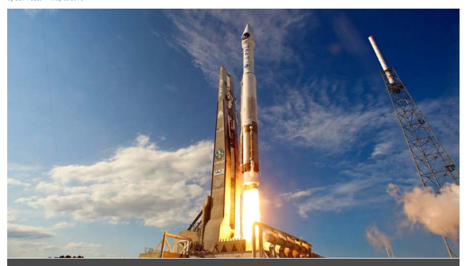
A United Launch Alliance Atlas 5 launch earlier this year. A union representing nearly 600 ULA workers is recommending members reject a ULA contract proposal in a vote this weekend.

WASHINGTON — A union representing nearly 600 United Launch Alliance employees is urging its members to reject a proposed contract in a vote this weekend, a move that could set up a strike.