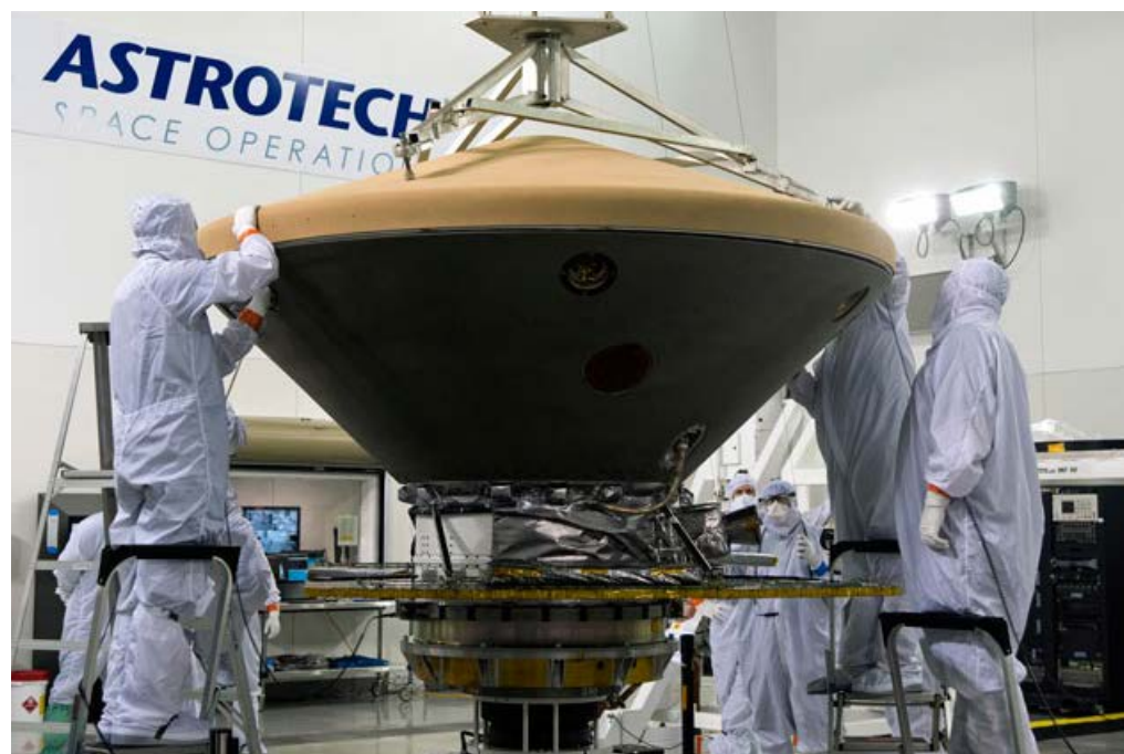
In the Astrotech facility at Vandenberg Air Force Base, the heatshield is placed on NASA's Interior Exploration using Seismic Investigations, Geodesy and Heat Transport, or InSight, Mars lander.

Launch of InSight spacecraft expected to attract thousands of spectators to Lompoc Valley