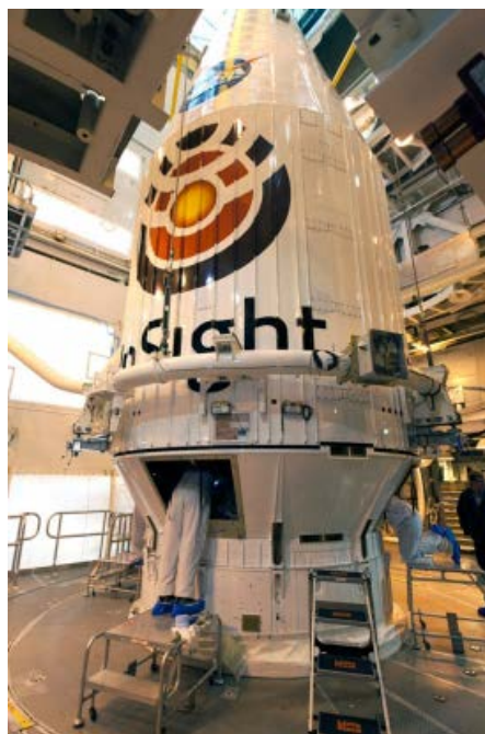
At Space Launch Complex 3 at Vandenberg Air Force Base, NASA's Interior Exploration using Seismic Investigations, Geodesy and Heat Transport, or InSight, Mars lander has been mated atop a United Launch Alliance Atlas V rocket.

Guests should arrive after 2:30 a.m. InSight team representatives will be available to answer